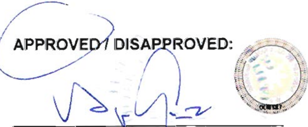
PRESIDENT BENIGNO S. AQUINO III NOV 2 8 2012